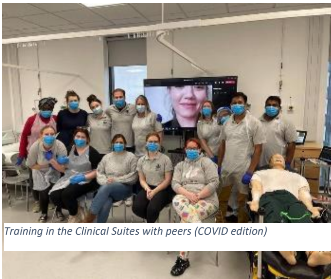
Training in the Clinical Suites with peers (COVID edition)

I had to work really hard to pass my A Levels and I still think to date it was the hardest academic time of my life. At AS I achieved an E grade in sociology, which really motivated me to work hard to get to my spot at university. I ended up receiving an A, B and C grade respectively.