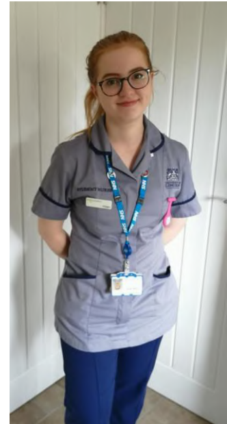
Last day as a student nurse!

Unfortunately, my course was hit exactly halfway through by COVID, and unlike other courses who could continue courses online, my whole course was rearranged to keep us protected but also ensure we meet the qualification requirements for the NMC (Nursing and Midwifery Council) so we could become registered nurses in time.