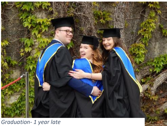
Graduation- 1 year late

We were told to continue with placements, however the learning opportunities we were expecting were completely changed and we were met with training on PPE, respiratory diseases and witnessing some very upsetting times with patients. I managed to achieve my 2300 hours of each practical and theory training and graduated university the following spring with First Class Honours - something I am extremely proud of given the circumstances.