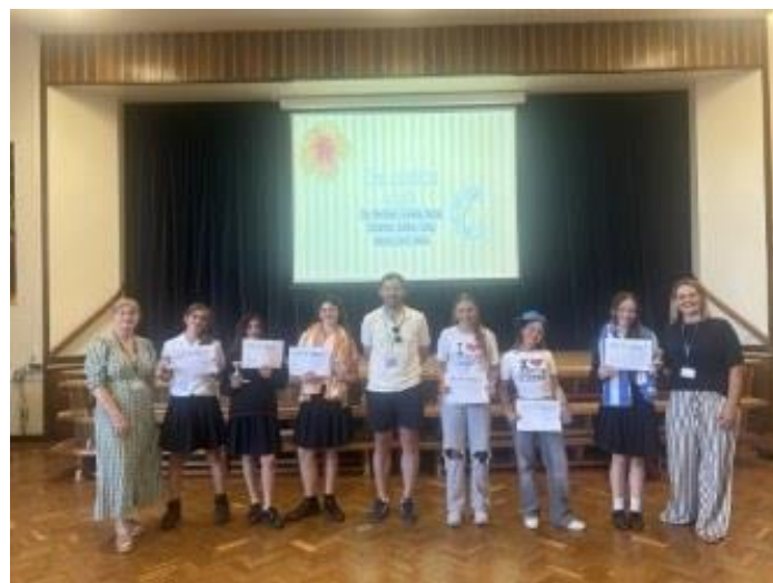
The winning team members in 7P with the judges.