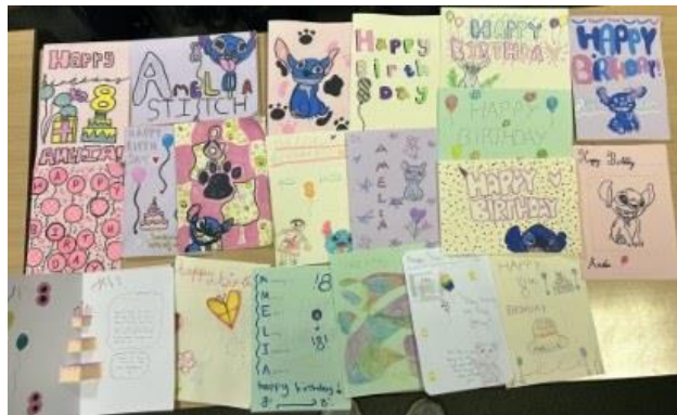
A selection of the cards made for Amelia from 7C

Please see here the latest BBC News report on the story. Amelia already has over 90,000 cards!