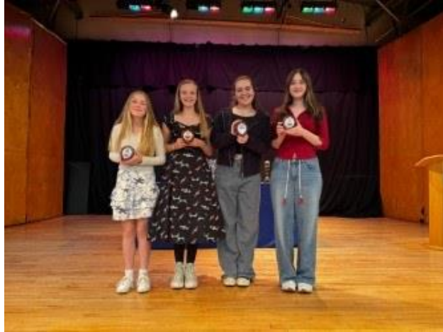
2 - Outstanding Individual Contribution Awardees for Performing Arts