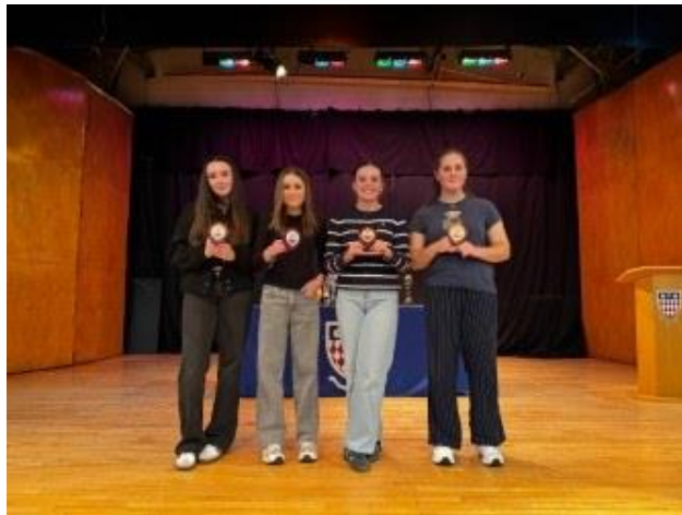
3 - Outstanding Individual Contribution Awardees for Sports