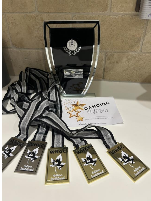
5 - Marnie's awards