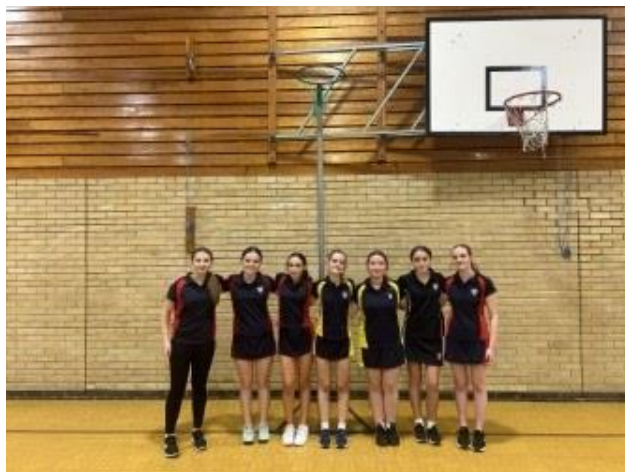
4 - On Monday 3rd November, the Y10 netball team played against University Academy Long Sutton.