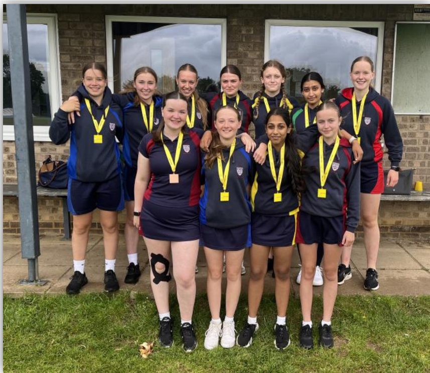
U15 cricket team at Nettleham Cricket Club with winners medals

On Thursday, the U14 football team made it through to the final day of the 'Sisters In Sport' National Football Tournament at Loughborough University. The team will now play in a semi-final and hopefully a final on the day (Tuesday 11 th June). The teams that have made it to the final day come from across the country including London, Yorkshire and Hampshire. Another massive achievement whatever the outcome, as once again, most finalists are from private schools.