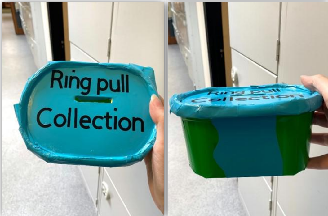
Examples of a container design – an upcycled butter container decorated with vinyl off-cuts