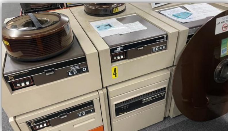
Hard Drive Storage circa. 1970

This was a great experience and seeing some of the technology that we have discussed in lessons and how some of the techniques apply in the real world will be extremely valuable.